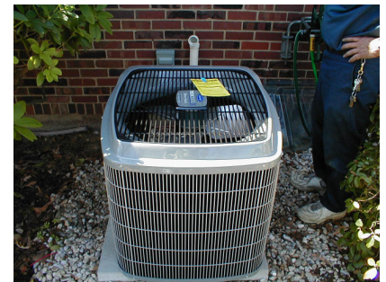
Required Superheat Values for Non-TXV Split System Air Conditioning System

To properly charge a system, add or remove refrigerant until the actual superheat value is within \pm 5^{\circ}\text{F} of the value obtained from the chart below. If the actual superheat value is higher than what is stated by the chart, add refrigerant to the system. If the actual superheat value is lower than what is stated on the chart, remove refrigerant.